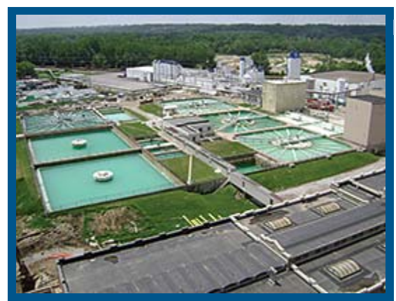
Figure 1: City of Cedar Rapids Water Treatment System