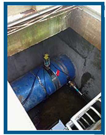
Figure 3: FPI-X FM Installed At SW Bowling Booster Station

The FPI-X product configuration is the newest line extension of the successful FPI Mag® product line from McCrometer. As Greg Webster, Sr. Applications Specialist at McCrometer describes, "Our traditional FPI Mag has been on the market for about 3 years now and is seeing wide acceptance in municipal and industrial markets. For the bulk of the applications we see, our FPI Mag is the perfect fit. However, there are specific applications where the FPI-X configuration is best. McCrometer developed the FPI-X to accurately measure flow from multiple pumps in series and can measure flow where almost no other technology can."