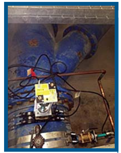
Figure 4: FPI-X FM Installed At NE J Avenue Booster Station

Cedar Rapids' new FPI-X Mag dual sensor assembly units have been operational for over 24 months at both of the city's booster station sites. One FPI-X Mag meter was installed on the single 30-inch line at the SW Bowling Booster Station to measure accurately the flow from its three centrifugal pumps (Fig 3). Two FPI-X Mag meters were needed at the NE J Avenue Booster Station, each measuring the total output of four vertical turbine pumps on two 24-inch lines (Fig 4).